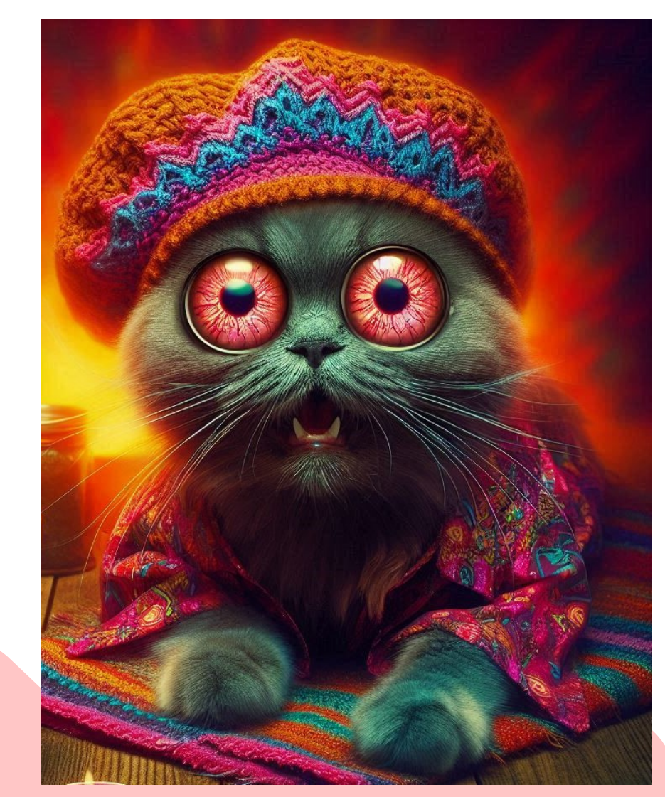
"Hippie Cat," DALL-E 3, 2024

Artificial Intelligence can Hallucinate!