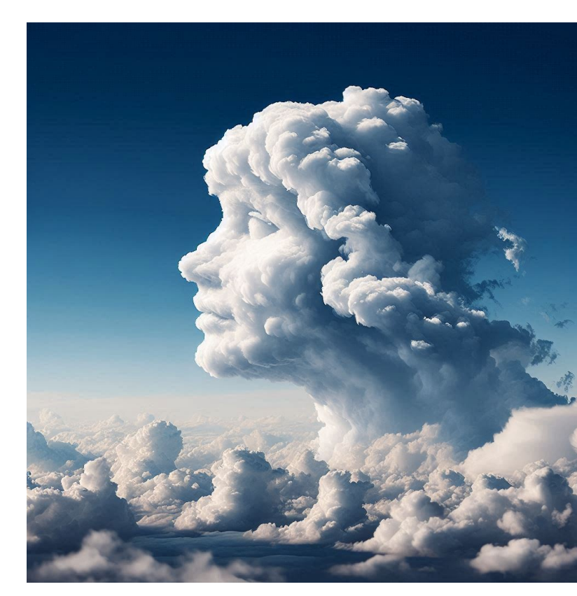
"Cloudy Illusion of woman's face," DALL-E 3, 2024