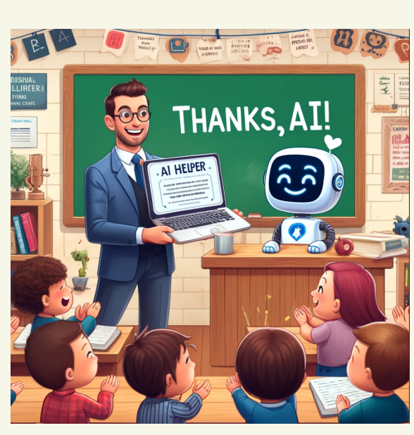
("Thanks, AI," 2024)

Why? Differentiation helps maintain academic integrity by distinguishing your contributions from the AI's output. You don't want AI getting credit for your output, nor do you want people to attribute an AI's errors to you. Be clear about the boundaries.